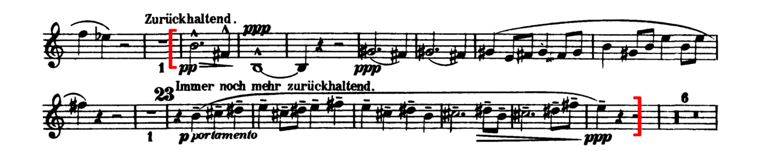
Mahler - Symphony No. 2 - Mvmt. 5 - 11 to 12 - Horn 4 in F